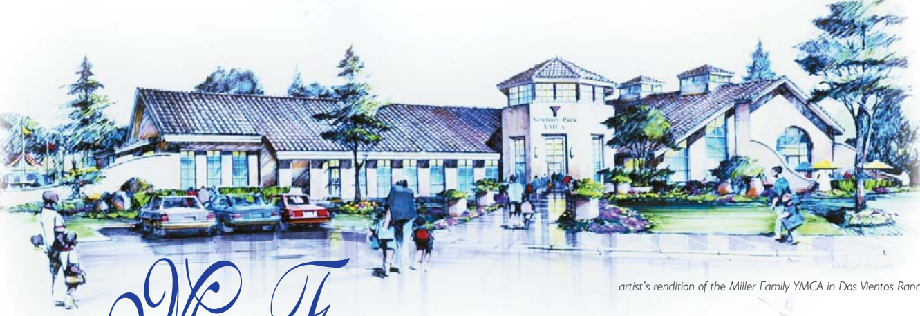
artist's rendition of the Miller Family YMCA in Dos Vientos Ranch